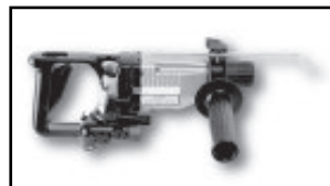
HD08 Hammer Drill

Wood or steel drilling, concrete core or hold drilling, or blast holes is no problem with Stanley's complete line of drills. Also take a look at Stanley's impact wrenches for drilling in wood utility poles and large timbers.