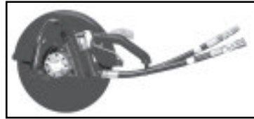
C025 Cut-off Saw