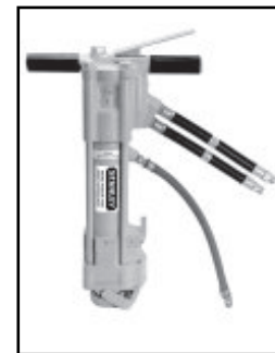
SK47 Sinker Drill