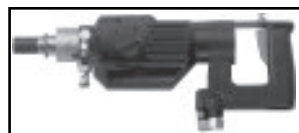
CD10 Core Drill