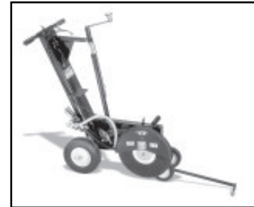
C025 w/optional Saw Cart (No. 33281)