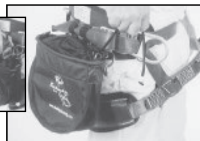
45702P1S2 - Purple Cordura 45702C4S9 - Heavy White Canvas