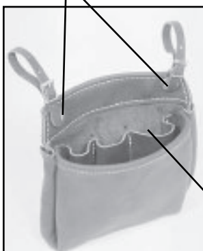
*52993 Inside Pockets

Leather straps w/grommet reinforced holes