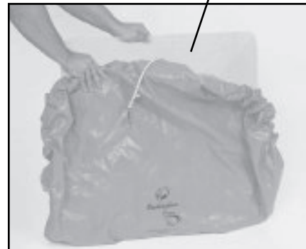
45455 Fiberglass insert

* Aerial covers are available in orange, black, and yellow 18oz. vinyl.