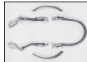
38A - Cut Straps 12" with 4 holes

30 Travis Avenue, PO Box 1690, Binghamton, NY 13902-1690 Phone 607-773-2405 • Fax 607-773-2414 • www.linemenssupply.com