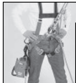
Split Tail and Micro Pulley "tied in" and ready to climb.