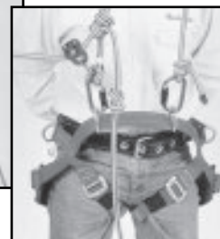
Split Tail shown rigged in a dual anchorage point system.