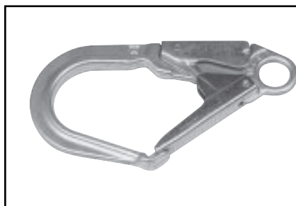
3130 Large Locking Ladder Snap (Option R) 1" eye (I.D.) 2.500" opening 9 3/4" length 1 lb. 8 oz. weight Rated to 5,000 pounds