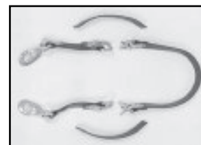
38A - Cut Straps 12" with 4 holes

30 Travis Avenue, PO Box 1690, Binghamton, NY 13902-1690 Phone 607-773-2405 • Fax 607-773-2414 • www.linemenssupply.com