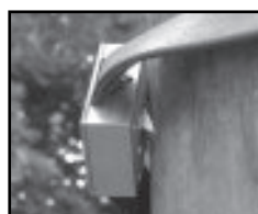
The BuckTooth, Model 485, is an accessory that must be installed when climbing iced poles.

*Brings a user into compliance with OSHA 1910.269 (g)(2)(v) requirements.