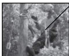
A second positioning strap, 48119Y (see page 16), can also be used to secure the user when climbing over obstacles.