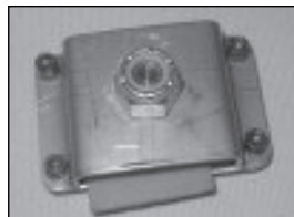
Swivel Plate Steel Retractable Lanyard Mounting Bracket Min. tensile strength 5000 lbs.