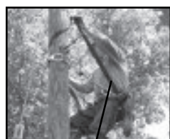
8' Retractable Lanyard, Model 5008-80F+N, mounts on the body belt & secures the user when climbing over obstacles.