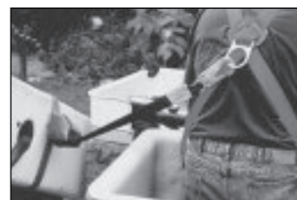
Retractable Lanyard that mounts to the boom.

For use in an aerial lift truck. Attach directly to boom.