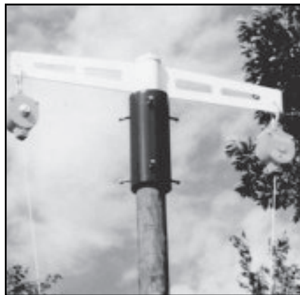
52032 Dual harness beam