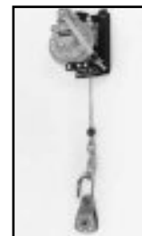
5010 Includes pulley and carabiner