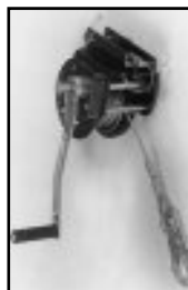
5002 Includes pulley and carabiner