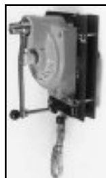
5000 Includes pulley and carabiner

Above winches come in 50, 65 or 100 ft. lengths. Please specify length desired. Winches available with spectra rope (Kevlar) lifeline by adding suffix "K" to model number.