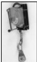
5001 Includes pulley and carabiner