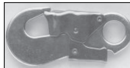
1708 Aluminum Body Locking Rope Snap Hook (Option +6) 7/8" eye (I.D.) .718" opening 5 1/4" length 5.4 oz. weight Rated to 5,600 pounds