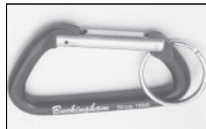
*5005NK Non-Locking Key Chain Carabiner

Length – 4" Opening – .78" Breaking Strength – 5172 lbs.