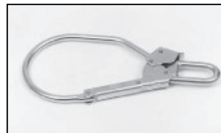
3034 (Option B) Large Locking Rebar Hook 15/16" eye (I.D.) 3 11/32" opening 13" length Rated to 3968 lbs. (Only to be used on shock absorbing style lanyards)