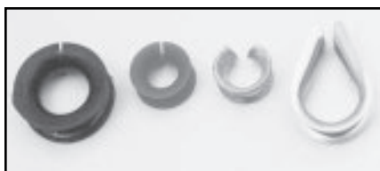
Thimbles 5/8" 350411 plastic 1/2" 350410 plastic 1/2" 350408 metal 1/2" 350409 metal