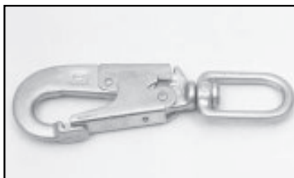
1704 (Option 8) Swivel Locking Rope Snap 1" wide eye 13/16" opening 7 1/16" long Rated to 5000 lbs.