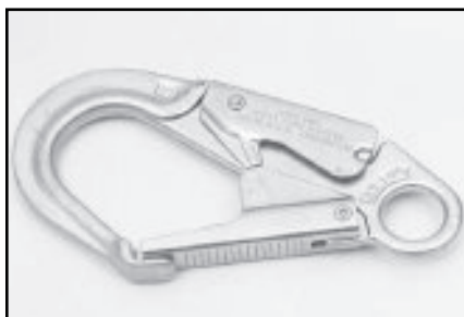
3129 Small Locking Ladder Snap (Option Z) 1" eye (I.D.) 1.750" opening 8 1/8" length 1 lb. 3 oz. weight Rated to 5,000 pounds