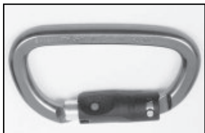
5555SA Ball Lock Aluminum Carabiner

Length – 4 1/4" Opening – 1" Breaking Strength – 8,992 lbs.