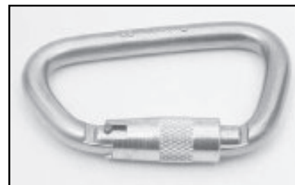
*5005T Twist Lock Steel Carabiner

Length – 4 1/2" Opening – 1" Breaking Strength – 11,240 lbs.