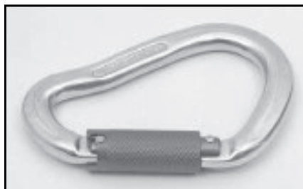
5005SA Auto Lock Aluminum Carabiner

Length – 4 1/2" Opening – 3/4" Breaking Strength – 6700 lbs.