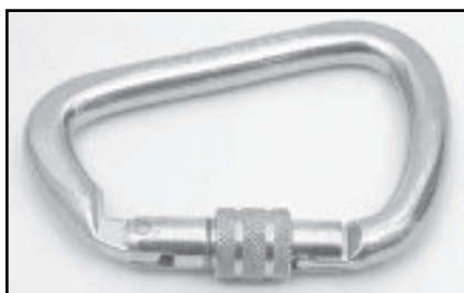
*5005M Screw Gate Steel Carabiner

Length – 4 1/2" Opening – 1" Breaking Strength – 10,116 lbs.