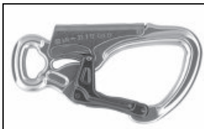
1710 Auto Lock Aluminum Carabiner

Length – 4 1/2" Opening – 3/4" Breaking Strength – 6700 lbs.