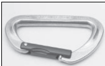
*5005NIA Non-Locking Aluminum Carabiner

Length – 4 1/2" Opening – 1 3/16" Breaking Strength – 5000 lbs.