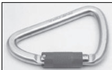
5005 Auto Lock Steel Carabiner

Length – 5 1/4" Opening – .71" Breaking Strength – 5620 lbs.