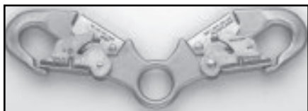
3032L Spreader Snap Hook 1" eye (I.D.) 9" long 5/8" opening Rated to 5,000 pounds