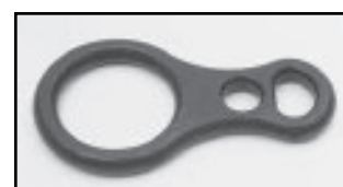
5009 Figure 8 without Ears