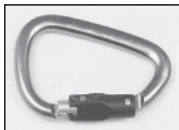
5555WSA William Ball Lock Aluminum Carabiner

Length – 4 1/4" Opening – .91" Breaking Strength – 6295 lbs.