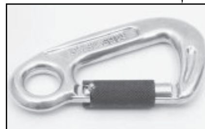
5005SAE Auto Lock Aluminum Carabiner with eye (Option U)

Length – 5 1/2" Opening – 3/4" Breaking Strength – 7000 lbs.