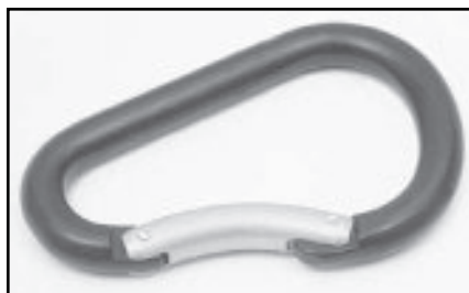
*5005NA Non-Locking Aluminum Carabiner

Length – 4 1/2" Opening – 1" Breaking Strength – 5625 lbs.