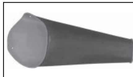
Straight Arm Two-Color