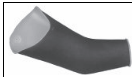
Curved Arm Two-Color