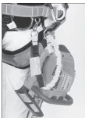
"Suspended on saddle."