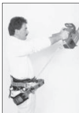
"Fully stretched and ready to cut."