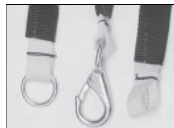
"Saddle attachment options."