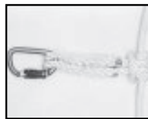
P7J233 33" Eye to Eye 1/2" 3 Strand Nylon (Carabiner not included). Also available with 1706 Locking Rope Snap - PJ72V33