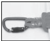
P7J624 24" Eye to Eye 12 Strand 3/8" Coated Tenex (Carabiner not included). P7JV24 has 1706 rope snap. 34" & 40" also available.