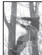
"Simply disconnect original leg of lanyard and continue climb."