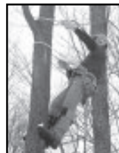
"He then attaches second leg of lanyard to tree above obstruction and connects to saddle."