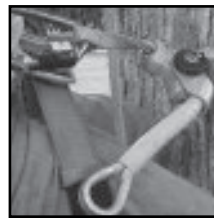
24S-7 Flipline connection strap is an inexpensive alternative to a locking twist clevis for proper orientation of your mechanical adjustment style microcenter. Simply girth hitch to the ascender and connect to your Dee ring using a self closing, positive locking type carabiner. The strap adds approximately 4" to the work positioning system. The strap can also be cut as a last resort to perform an aerial rescue if used with a wire core flipline.