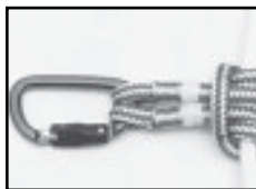
P7J8A26 26" Eye to Eye 16 Strand 1/2" Blue Streak (Carabiner not included)