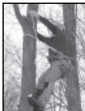
"Climber approaches an obstruction."

The Prusik Loop is made of 16 strand 1/2" braided blue streak rope, which is looped around a 3-strand twist nylon rope. The combination of braided rope and twisted rope offers the best combination for this application.