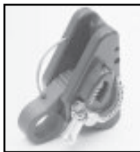
5004A For use with 1/2" diameter rope only. (Add suffix "M" to model number)

7V08B110M 10' High Vee with microcenter 7V08C112P 12' Safety Blue with Gibbs ascender 7V08D114M 14' XTC Spearmint with microcenter