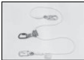
Prusik Lanyard 7VV2A110J (Carabiner not included, see page 29.)

The 2 in 1 Safety Prusik Lanyard provides the user a means to stay continuously secured to the tree when climbing over obstructions. Buckingham uses different color thimbles to easily distinguish each end of the lanyard. This eases the task of climbing over obstructions. This particular model is 10' in length. Available in any length desired by designating the last numeric digit as the length, i.e. 7VV2110J (10' length).