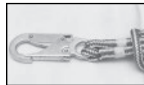
P7J8AV26 26" Eye to Eye 16 Strand 1/2" Blue Streak Hip Prusik with 1706 Locking Rope Snap