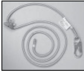
7V08A110M (10' length Bluestreak)

The adjustable fliplines from Buckingham makes climbing with lanyards safer and easier. The addition of the microcenter gives the user the ability to easily adjust the length of the lanyard with one hand. With the microcenter at the user's side, (where it's needed) no longer will the user have to hug the tree to adjust his lanyard. Unlike other adjustable lanyards that only adjust to one half of their total length, the adjustable flipline will adjust from just a couple of inches up to its full length. Each flipline comes with a 1706 Locking Rope snap on one end and an eye splice on the other to prevent rope from slipping through the ascender. Fliplines are available in custom lengths of 1/2" Bluestreak, Safety Blue, High Vee and XTC Spearmint. Also available with Gibbs ascender. (Add Suffix P) Last two numeric digits designate lanyard length.