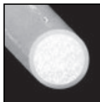
The 1-1/4" diameter JE pole starts with a solid foam mandrel. Fiberglass is laid over the mandrel in a lengthwise and wrapping motion for superior strength.

If you're looking to save a little money without sacrificing quality, the FG-Series hollow fiberglass pole is the one for you. This alternative to the foam core pole is Jameson's most popular fiberglass pole. The FG-Series uses the same aircraft grade aluminum ferrules and exterior leaf spring as the JE-Series.