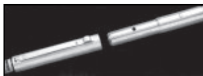
External leaf spring locking ferrule for JE and FG Series.

To insure safety, these sticks have been manufactured with a non-fiberglass surface veil that prevents fibers from blooming to the surface due to abrasion or ultra-violet exposure.