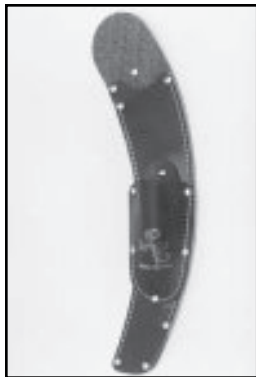
6515CPP Belting 6515PP Leather Designed to hold curved blade hand pruning saws with a 16" blade. A leather pruner pouch is included to hold a wide range of hand pruners. Scabbard 3 1/2" x 19 3/4" overall length 3" x 15" pocket Pruner Pouch 2 1/2" x 5 3/4"