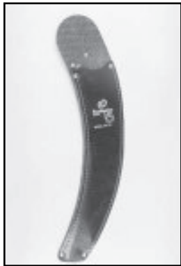
6515C Belting 6515 Leather Designed to be used with curved blade hand pruning saws with up to a 16" blade. 3 1/2" x 19 3/4" overall length 3" x 15" pocket

Buckingham's line of pruning saw scabbards are made from the highest quality top grain leather or rubberized belting material available. They feature a 1/2" nylon washer and double thick leather spacers on the tooth side to ease inserting and removing the saw from the scabbard. A 1 1/8" steel ring is attached to the back 3" down from the top to suspend scabbard and saw closer to the user. Clean out openings on the side and bottom prevent buildup of saw chips and dust in the bottom of the scabbard.