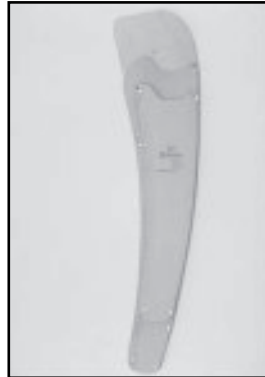
6223 Leather 6223C Belting Dual saw scabbards. Large pocket is designed to be used with curved blade pruning saws with up to a 24" blade. Small pocket fits curved blade pruning saws with up to a 16" blade. Large Pocket 26" overall length 21" pocket depth Small Pocket 17" overall length 16" pocket depth