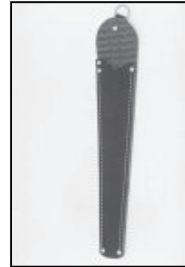
6016C Belting 6016 Leather Fits straight blade hand pruning saws with up to a 16" blade. 19 1/2" overall length 14 1/2" pocket depth