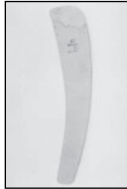
6226 Leather 6226C Belting Fits curved blade hand pruning saws with a 26" blade. 30" overall length 26" pocket depth