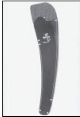
6222C Belting 6222 Leather Fits curved blade hand pruning saws with 22" and 24" blades. 26" overall length 21" pocket depth